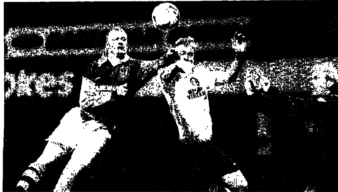
Still no delight for Dowie... West Ham's Ian Dowie attempts to end his goal drought as he challenges for the ball with Manchester United teammates David May and Peter Schmeichel.

Dumitrescu began the game, with his compatriot on the bench, but it was Redknapp's decision to